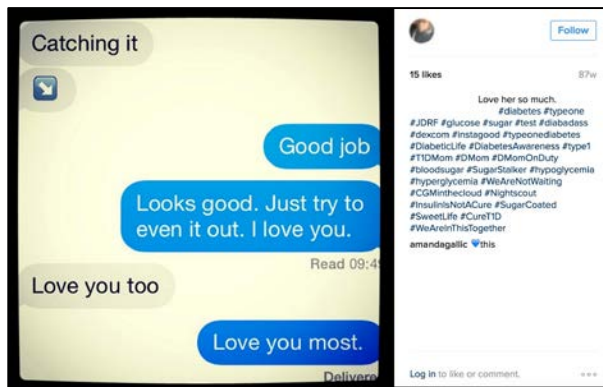
Figure 2. A text message exchange [5] between mother and daughter on managing dropping blood glucose with real-time data using Nightscout. “Catching” low blood glucose levels involved parental emotional care work that attends to the person, not just the number.

eats...We change basal rates and bolus rates [used in insulin treatments] and sensitivities. We try to do the best we can.” While steady glucose levels can lead to improved long-term health outcomes, the pursuit of ‘good numbers’ can sometimes conflict with ‘good care.’ Later in the same interview, this father wryly acknowledged to us that his teenage daughter “ didn’t love ” her parent’s obsession with her data: “ We were checking her too much...And she wants to shoot me sometimes, and my wife as well sometimes, because we are always on her about her diabetes...I’ve got to watch that, because I’m on her too much...There’s definitely a quality of life thing to this...I know I don’t have the right mix. ”