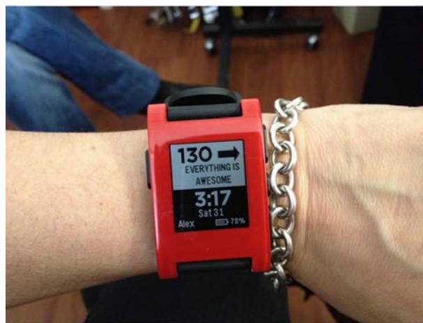
Figure 1. The top image shows how Nightscout can track and display blood glucose levels in real-time. The bottom image shows that, by uploading their children’s blood glucose data to the cloud, it enables the remote monitoring of CGM data through mobile devices like Pebble Watches.

To address such barriers, Nightscout users developed a range of digital tools, social support, and organizational resources, including: websites, instructional YouTube videos, an associated 501(c) 3 foundation, community certificates and awards, diabetes conference presentations, ‘install parties,’ and a thriving Facebook group called