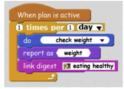
Figure 1.3 This mockup shows a fragment of a self-care plan to prompt the user once a day to record his weight. The variable weight is defined elsewhere as being of type number, so the user will be prompted to enter a number. This request also recommends an information digest about healthy eating.

'he feedback on the monitoring of those activities to the caregiver and/or a clinician